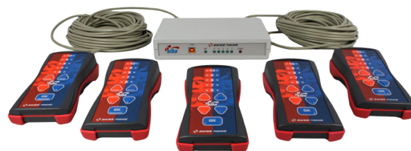
BSS2013 Keypads and Controller